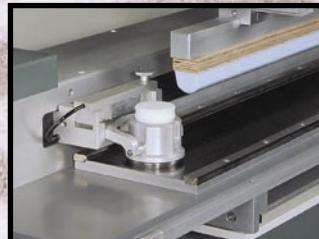
Closed cup system

Precision engineered for superior quality printing