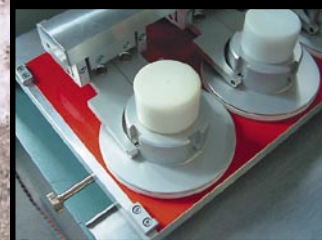
Closed cup system