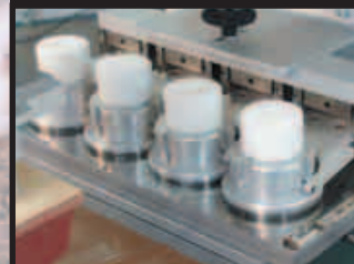
Closed cup system