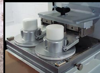
Closed cup system