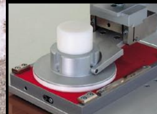
Closed cup system