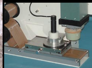
Viscomatic ink control