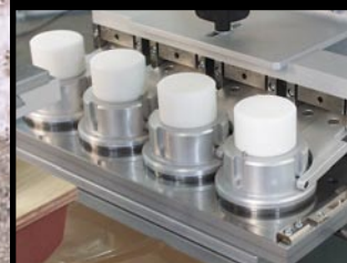
Closed cup system